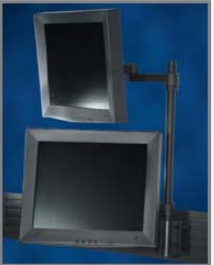
Tilts & Turns