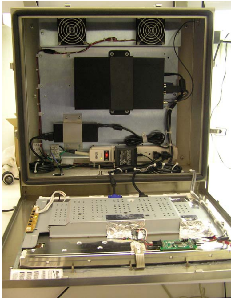
Figure 1 VT150ESCHBU series computer